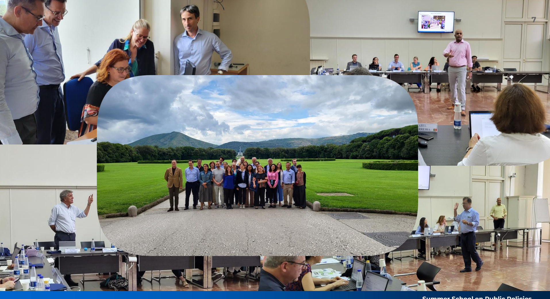
Summer School on Public Policies